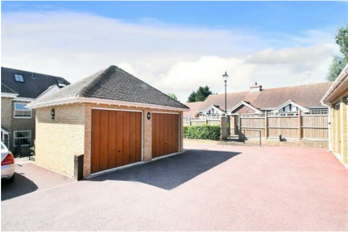
Bungalow - Detached (EPC Rating: )